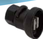
Flat jet nozzles XR 8007 VS (gray) Art.No. 11612807-SB