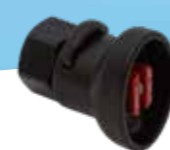
Flat jet nozzles XR 8005 VS (red) Art.No. 11612805-SB