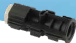
Foam nozzle Art.No. 11688701