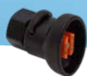
Flat jet nozzles XR 8001 VS (orange) Art.No. 11612801-SB