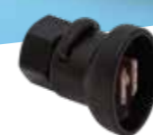
Flat jet nozzles XR 8006 VS (brown) Art.No. 11612806-SB