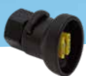
Flat jet nozzles XR 8003 VS (yellow) Art.No. 11612803-SB