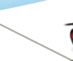
Spray tube 1 m straight, stainless steel Art.No. 11669802