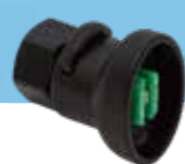
Flat jet nozzles XR 8002 VS (green) Art.No. 11612802-SB