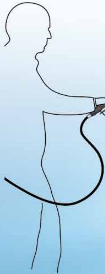
Stainless steel fittings with flat jet nozzle TPU 8002 PP

In addition, the C 50 is equipped with a switchable mixing function. A chemical resistant one Diaphragm pump and stainless steel fittings allow the application of diluted acids and alkalis for cleaning and disinfection.