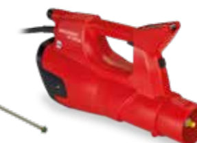
AS 1200 AC1 Art.No. 12129001