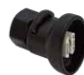
Flat jet nozzles XR 8008 VS (white) Art.No. 11612808-SB