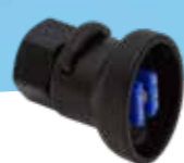
Flat jet nozzles XR 8004 VS (blue) Art.No. 11612804-SB