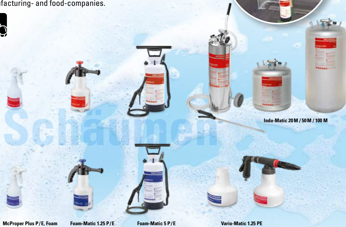
Indu-Matic 20 M / 50 M / 100 M