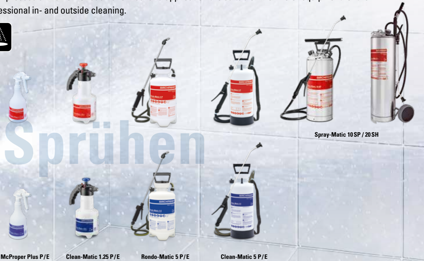
Spray-Matic 10 SP / 20 SH