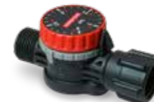
Adjustable pressure control valve PR 3