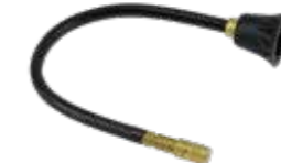
Extension tube 26 cm bendable for Super Star 1.25