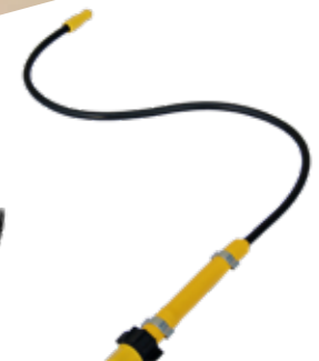
Mini-Flex: The flexible extension for dusting and spraying